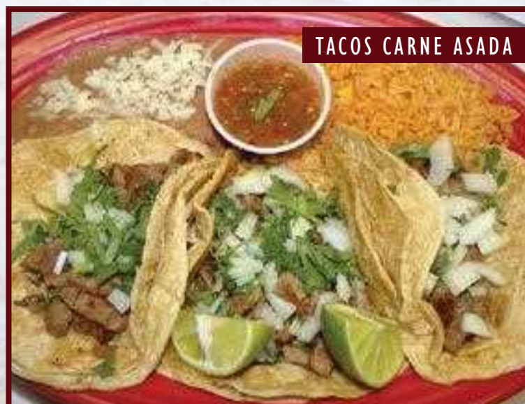
TACOS CARNE ASADA

Three soft tacos with pico de gallo and sour cream