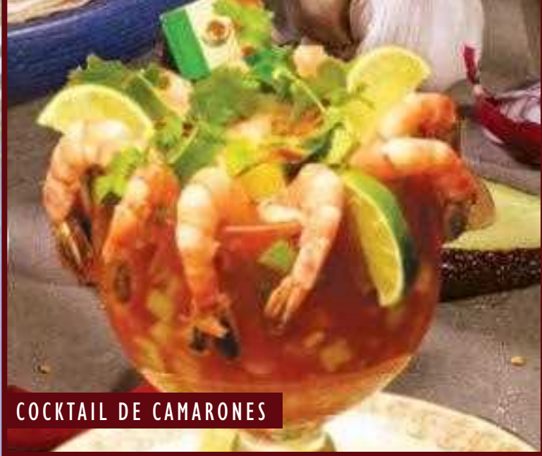
COCKTAIL DE CAMARONES

ADD $1.00 for cheese sauce when substituting for any red or green sauce