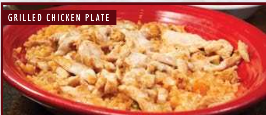
GRILLED CHICKEN PLATE

HEALTH ADVISORY: Consuming raw or undercooked eggs, meats, poultry or seafood may increase your risk of foodborne illness.